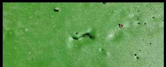
Pinholes in a liquid coating